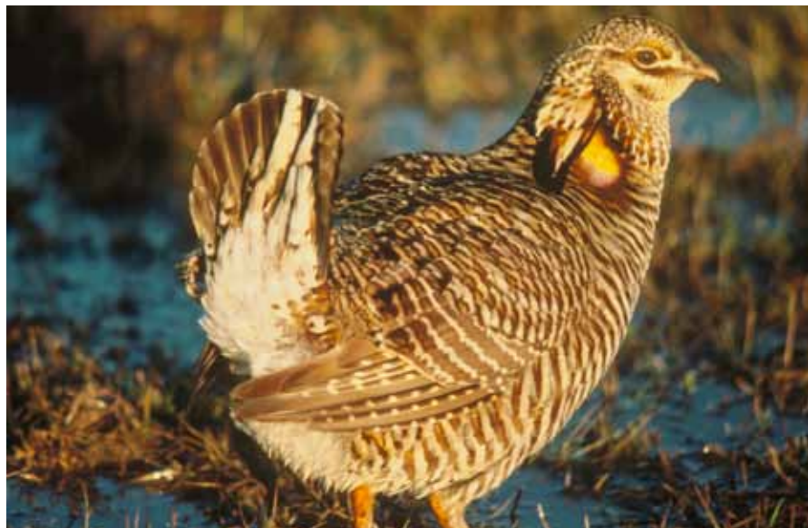
Attwater's prairie chicken.

Some areas may be inappropriate for large scale development because they have been recognized according to scientifically credible information as having high wildlife value, based solely on their ecological rarity and intactness (e.g., Audubon Important Bird Areas, The Nature Conservancy portfolio sites, state wildlife action plan priority habitats). It is important to identify such areas through the tiered approach, as reflected in Tier 1, Question 2 below. Many of North America's native landscapes are greatly diminished, with some existing at less than 10 percent of their pre-settlement occurrence.