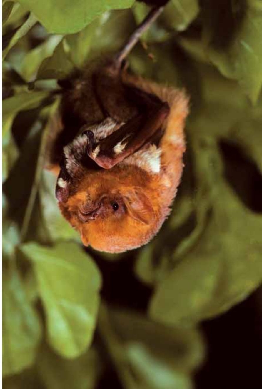
A male Eastern red bat perches among green foliage.

Fatality monitoring should occur over all seasons of occupancy for the species being monitored, based on information produced in previous tiers. The number of seasons and total length of the monitoring may be determined separately for bats and birds, depending on the pre-construction risk assessment, results of Tier 3 studies and Tier 4 monitoring from comparable sites (see Glossary in Appendix A) and