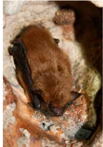
Big brown bat.

Comparing fatality rates among facilities with similar characteristics can be useful to determine patterns and broader landscape relationships. Developers should communicate with the Service to ensure that such comparisons are appropriate to avoid false conclusions. Fatality rates should be expressed on a per nameplate MW or some other standardized metric basis for comparison with other projects,